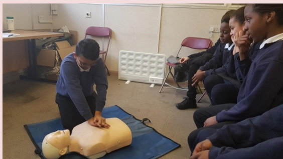
This group were learning CPR using a dummy.