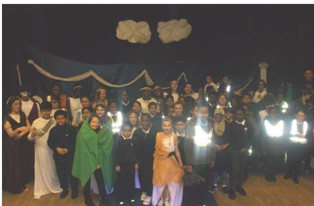
Here are some year 5 pupils with the Eastlea performers.

On the 3rd of February, year 5 went on a trip to Eastlea to watch multiple plays about Ancient Greek Myths performed by some of the Eastlea drama students from different year groups. Everyone from year 5 enjoyed the play as it was interesting play to watch and it also had some humour.